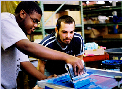
Learning in the Real World

Big Picture High School-Fresno, which is currently in development, will be a public charter high school that implements the Big Picture model of Education in Fresno. The school will be student centered, providing college prep coursework that meets the UC "a-g" requirements and community mentorships that are aligned with each student's passion. Students will also have the option to take courses at Fresno City College. For more information on the Big Picture Model, go to www.bigpicture.org .